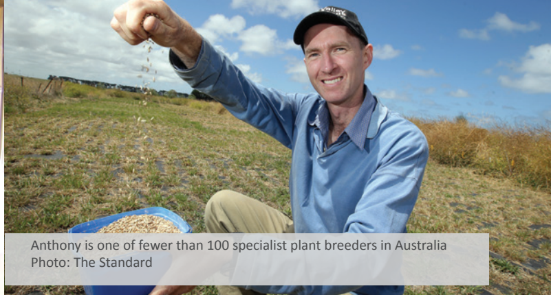
Anthony is one of fewer than 100 specialist plant breeders in Australia