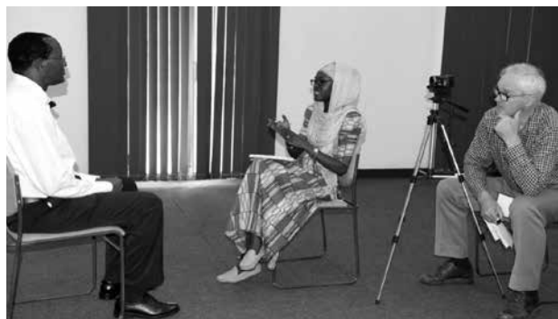
Mock media interviews underway in Nairobi

There have been two Crawford Fund communication master classes this year, in Kenya and, the latest, in India which was arranged for 25 researchers and extension officers involved in the International Rice Research Institute's mega project on stress tolerant rice. More on both of these events are on our website.