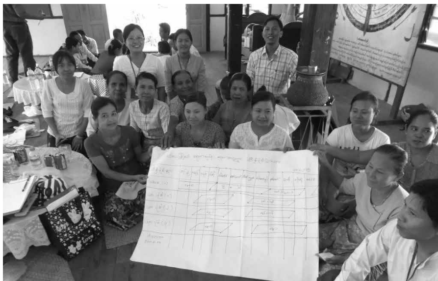
Female farmers in Myanmar displaying their seasonal calendar