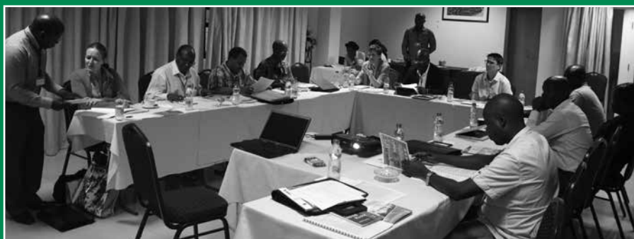
Educators meeting with demand-led project team at the University of Ghana