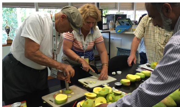
Mango training course participants testing mango dry matter and flower manipulation

Bill Gates, founder of the Bill and Melinda Gates Foundation.